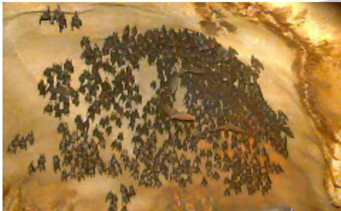
Fig. 2: A colony of bats in a cave