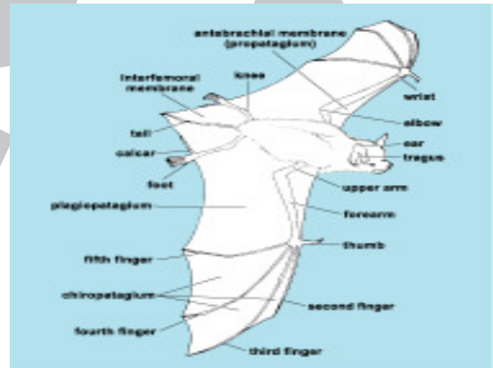
Fig. 3: External features of the bat